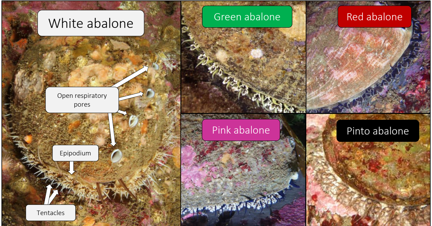
Card created in cooperation with the National Marine Sanctuary Foundation under federal award NA18NMF4540003 to support White Abalone Citizen Science Monitoring