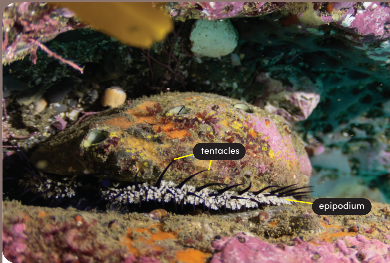
An adult pink abalone in a boulder crevice.